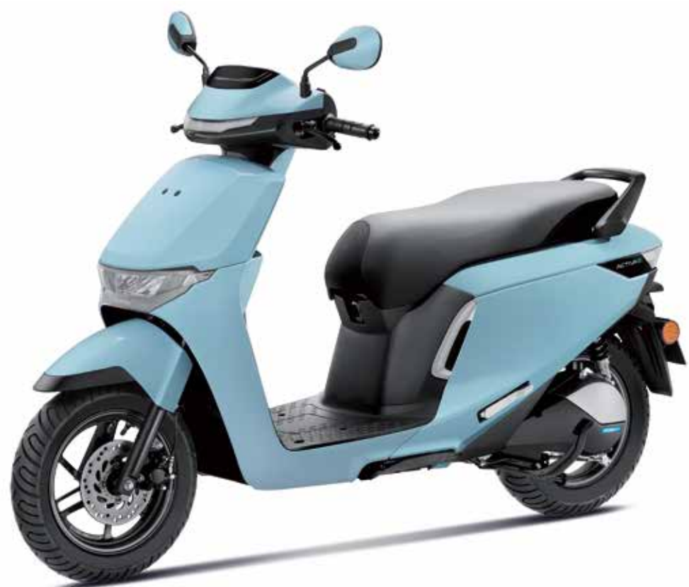
Pearl Shallow Blue

Choose the shade that complements your vibe.